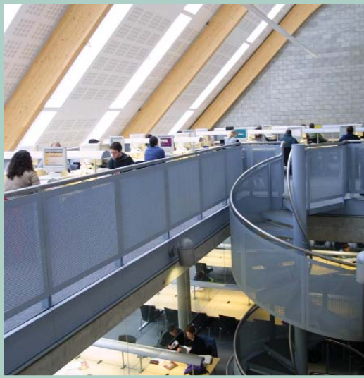
Luke Wadding Library