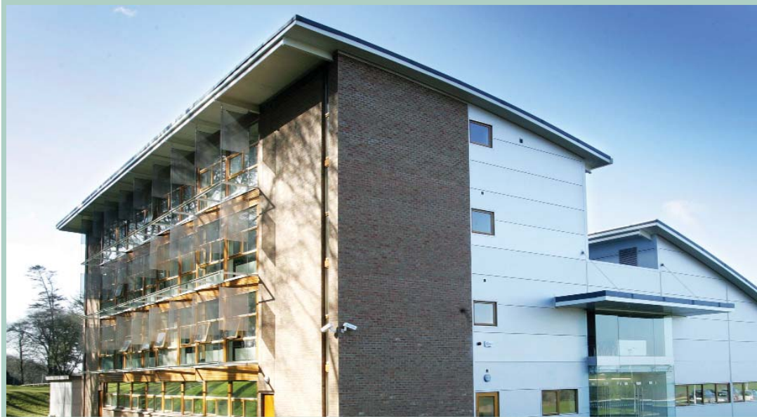
ArcLab Research and innovation Building This 2,400m 2 building provides facilities for housing many research, development, enterprise and innovation partners.

Projects identified and recommended in the HEA Review and Prioritisation of Capital Projects in Higher Education will be progressed under a public private partnership initiative. Planning for these projects is at an advanced stage and it is anticipated that the WIT secured projects will be completed and occupied in 2010.