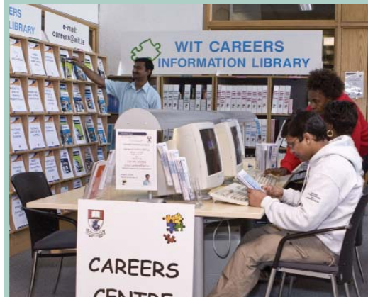
Final year students researching their career opportunities in the Careers Information Section of the Institute's state of the art library facility.

During the past two years its services have grown to include: