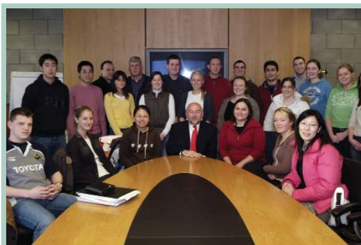
Ruairi Quinn TD, former Labour Party Leader and Minister for Finance pictured with WIT Masters in Business Studies addressing European Union Government Issues

feedback to the School and its staff was excellent during the report period. One of the major improvements in the students' experience has been the opening of the Walton Building where the School has six computer laboratories.