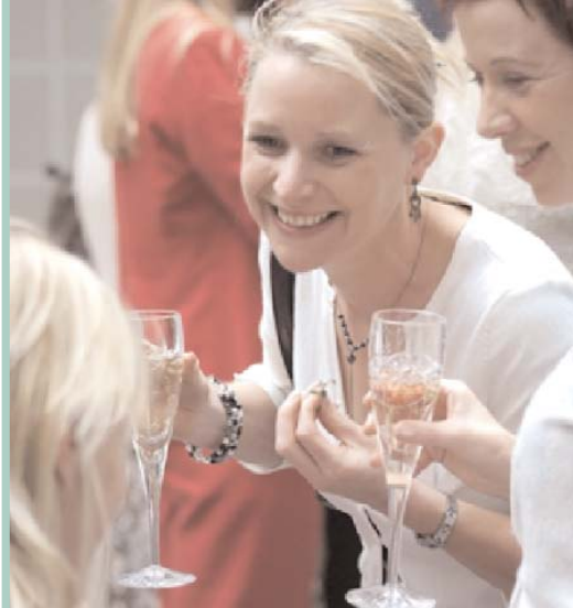
Classmates of 1997 enjoying their 10 year reunion