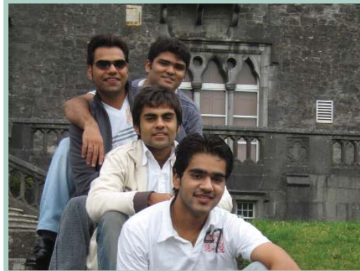
Students from University of Central Punjab visit Kilkenny Castle

Starting with only a hundred Erasmus exchange students in 2001, the Institutes International student population has grown to almost 700 students in 2007. These students include up to 17 categories - for example full-fee paying students from overseas, exchange students, year abroad students, refugees and children of migrant workers. They come from a total of 66 countries - the largest groups being from China, India, Pakistan, Nigeria and the EU.