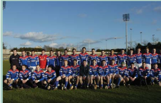
WIT wins the Fitzgibbon cup defeating UCE in the final at Pairc UI Rinn in Cork (March 2006)